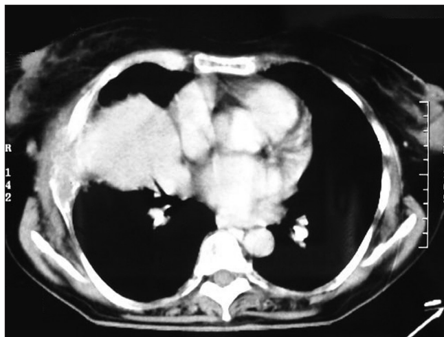
Figure 2: Computed tomographic scan of the thorax (CT thorax) revealing soft tissue mass in the right anterior chest wall with rib destruction and lytic lesions in lateral end of right clavicle and posterior end of fifth rib suggestive of metastatic deposits