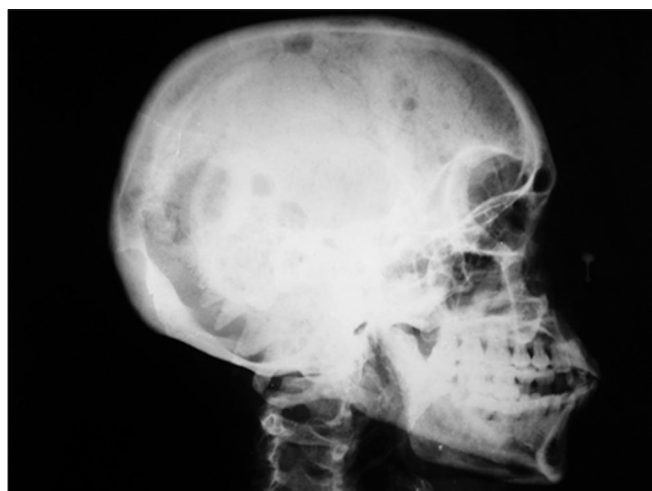
Figure 3: Skull radiograph revealing multiple lytic lesions

IgG immunoglobulin (3000 g/dl). Beta-2 microglobulin was 3815 ng/ml. Urinary examination for Bence Jones' proteins was positive. Bone marrow biopsy revealed a hypocellular marrow with more than 75% plasma cells and reduced myeloid and erythroid cells.