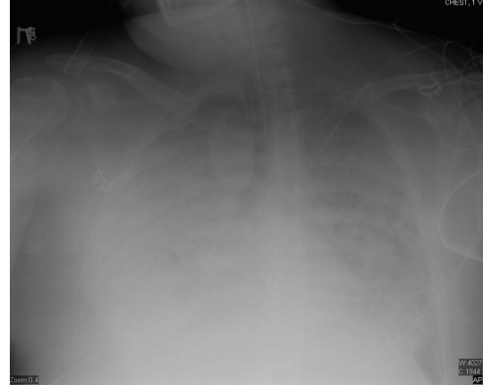
FIGURE 3: Chest X-ray day 22 after chemotherapy (ANC was 11,500 cell/ \mu L).