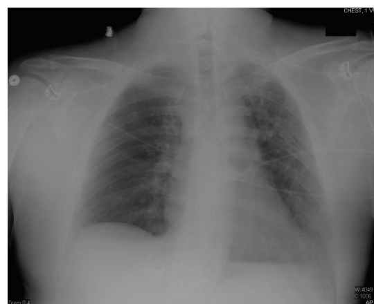
FIGURE 4: Chest X-ray day 31 after chemotherapy (ANC was 6700 cell/ \mu L).

immune system, the diagnosis of paradoxical immune reconstitution syndrome was made, and we started him on methylprednisolone 125 mg IV q 6 hours. Within 48 hours, his fever trended down and we were able to start weaning his oxygen requirements despite no significant change in his CXR (actually CXR did not show a significant change until 10 days later).