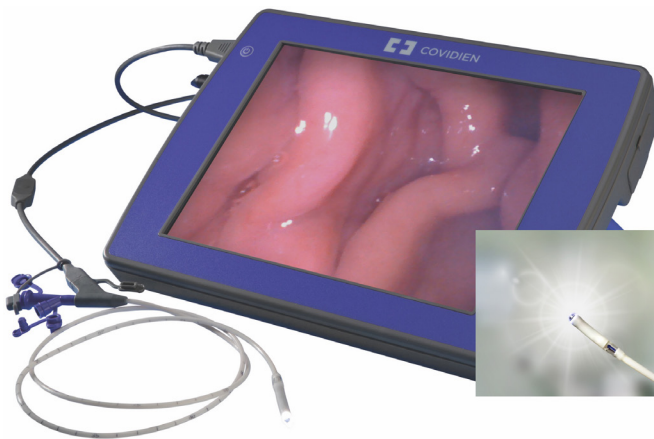
Figure 1 IRIS console, cable link and tube. IRIS, integrated real-time imaging system.

insufficient data to determine safety and no evidence-based guide on which to train operators.