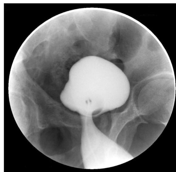
Figure 2 Oblique view of the urinary bladder and the diverticulum.

Pfannenstiel incision was done, retroperitoneal space was opened, and dissection around the right side of the bladder revealed a congested urinary bladder diverticulum entrapped through the femoral ring which was dissected and reduced back with difficulty. Diverticulectomy was then performed and the femoral hernia was repaired using a polypropylene