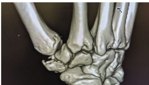
FIGURE 2: CT with 3D reconstruction detailing trapezium fracture.

The patient's joint was immobilized with a thumb spica splint for two weeks. Unrestricted range of motion exercises as well as occupational therapy were initiated two weeks following surgery. Three months after surgery, repeated X-rays showed a healed trapezium fracture (Figure 4). During this time, his DASH score was 10 and his SANE score [9] was 95.