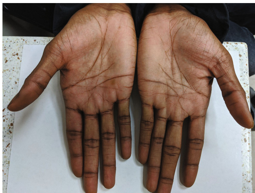
FIGURE 5: At 3 months follow-up, full range of motion of thumb demonstrated.

with a carpometacarpal subluxation, a decision was made to perform an open reduction and internal fixation of the fracture. We elected to use a headless compression screw over K wires as we believed that we would be able to begin early range of motion in our patient with the use of headless compression screw.