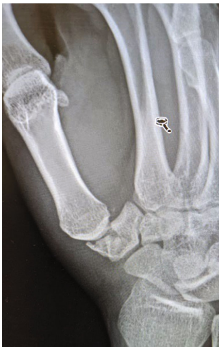
FIGURE 1: Plan radiograph at presentation demonstrating trapezium fracture with associated carpometacarpal subluxation.