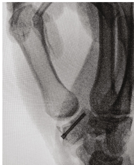
FIGURE 3: Fixation with 2mm headless screw demonstrating excellent fixation of fracture and congruity of the carpometacarpal articulation.

Trapezium fractures are rare among hand fractures. A high degree of suspicion for the injuries aids in their diagnosis. AP wrist radiographs can identify these fractures. A pronated view can allow for better visualization of the trapezio metacarpal articulation and identify displacements. However, there are reports of missed trapezium fractures in the litera-