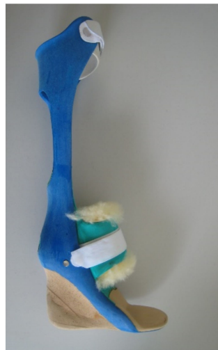
Figure 2. Example of an ankle foot orthosis designed for a severe equinus deformity (rigid version). The added heel shows the compensation for the gastrosoleus contracture.

Specific attention was given to the biomechanical construction of the AFO. The treatment aimed at aligning the foot to the thigh and direction of gait: with varus/valgus heel pads, pads under the midfoot, and pads under the forefoot in case of a supination deformity. The foot skeleton was held in the normal anatomical arrangement with the foot in equinus position if required by gastrosoleus contracture. A heel raise compensated for ankle plantar-flexion as much as was required to achieve a full heel contact when standing (Figure 2). A heel rise was added on the contralateral side if required to compensate for any leg length inequality.