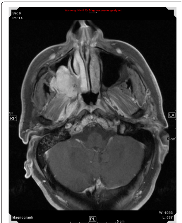
Figure 1 51 year old patient with adenoid cystic carcinoma extending from the right maxillary sinus into the right orbit and cavernous sinus, contrast-enhanced, T1-weighted MRI for treatment planning.