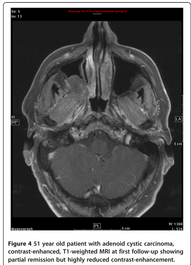
Figure 4 51 year old patient with adenoid cystic carcinoma, contrast-enhanced, T1-weighted MRI at first follow-up showing partial remission but highly reduced contrast-enhancement.