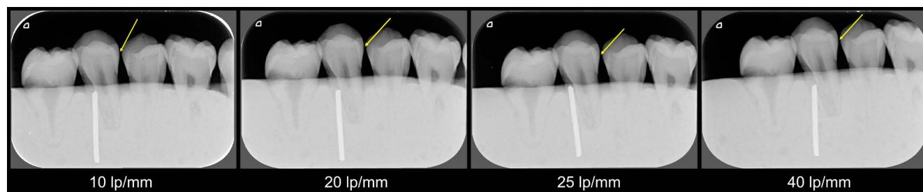
Fig. 2. Radiographic images with an enamel lesion seen in different resolutions.