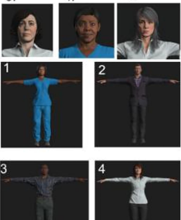
FIGURE 2 VHA prototypes used as print stimuli for focus groups 1 and 2

Researchers were able to adjust appearance of skin, fine lines, and hair color to modify perceptions of age.