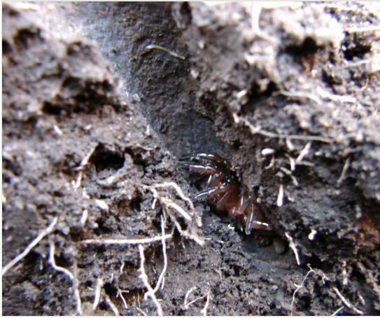
Figure 6. doi