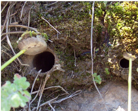
Figure 5. doi

This species is very rare on nature and very difficult to find due to the specific microclimatic conditions that it needs. It only inhabits steep shaded and very humid slopes, with burrows only found in association to some particular species of mosses Fig. 5.