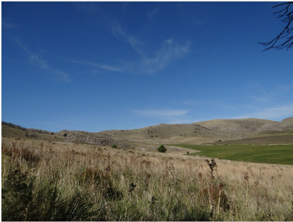
Figure 4. doi

Four subpopulations are known for this species. Two subpopulations are located at the Ventania mountain system Fig. 4 and the other two subpopulations are located at the Tandilia mountain system.