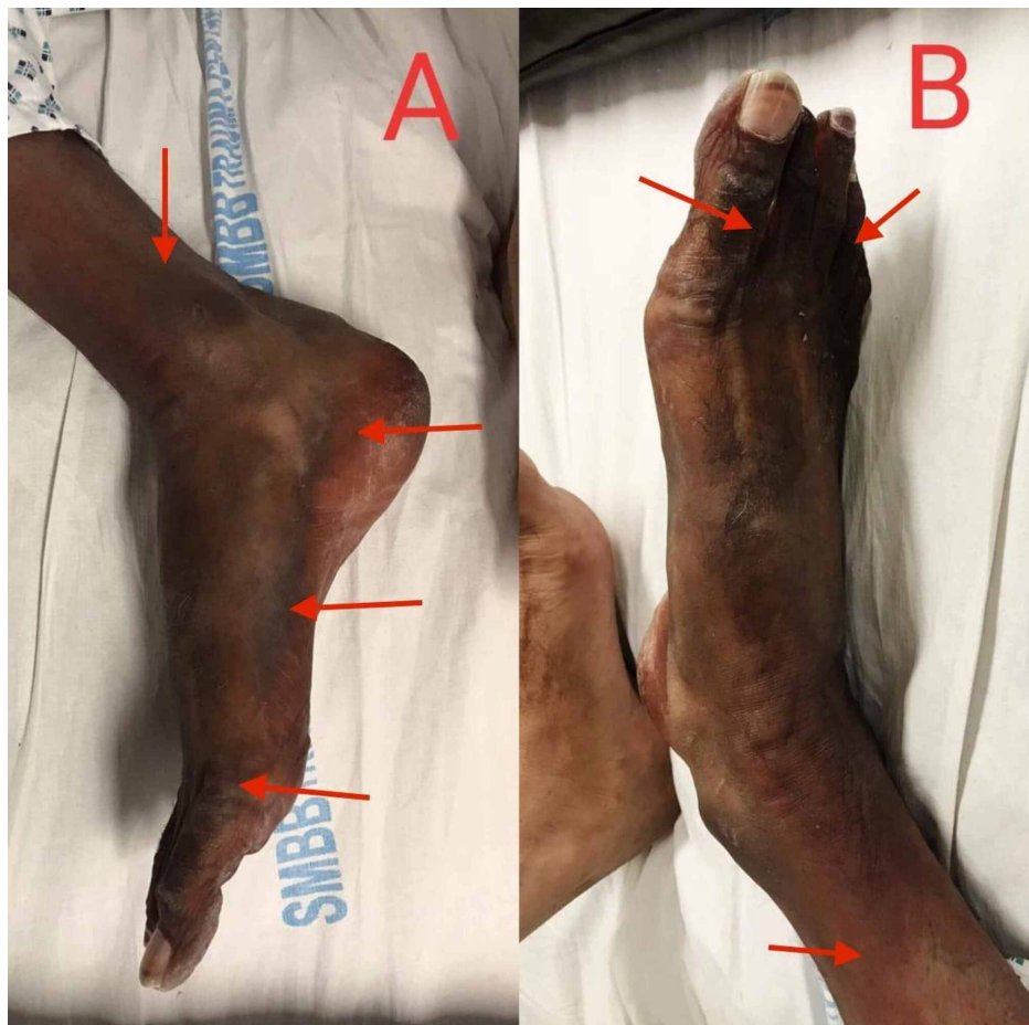
FIGURE 2: Ischemic limb of the patient

The image shows the right lower limb (arrows indicating blackened ischemic areas) of the patient three days after admission.