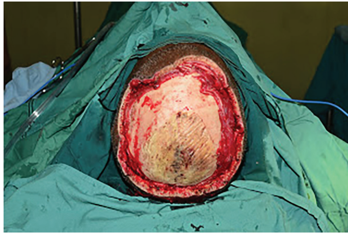
Fig. 3: Aggressive radical debridement.