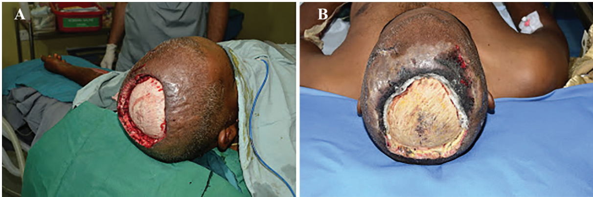
Fig. 2: A) Patient after first debridement. B) Development of fungal infection with fungal hyphae seen in the wound.