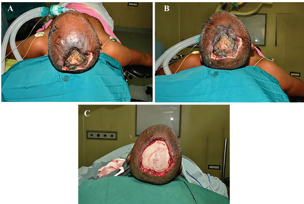
Fig. 1: A) Patient on admission at first debridement. B) Patient on admission at first debridement. C) Patient after first debridement.

On clinical suspicion of invasive fungal infection (zygomycosis), injection of amphotericin B was started and patient was taken for wide debridement. Tissue biopsy was taken and sent for histopathology examination. Outer bony cortex chiseling was done with high speed diamond burr. Histopathology report of specimen came out to be A. corymbifera . Intravenous amphotericin B injection was continued for 4-week period since diagnosis to complete healing. After two weeks of anti-fungal treatment, clinical condition of patient improved. After confirmation of absence of fungal infection, scalp defect was covered with free anterior lateral thigh flap (Figure 3). Recipient vessels were superior temporal artery and vein. In post-operative period, patient was on intravenous amphotericin B injection for 2 weeks. Post-operative period was uneventful (Figure 4A-B).