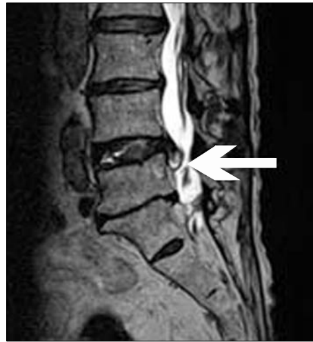
Fig. 1. T2-weighted magnetic resonance imaging (MRI) of the lumbar spine. Sagittal image showed a cyst in the ventrolateral epidural space of the 5 th lumbar vertebral (L5) level that communicated with the adjacent 4 th lumbar and 5 th lumbar intervertebral disc (arrow).

bar and 5 th lumbar intervertebral disc (Fig. 1). The cyst showed high signal intensity on T2-weighted images and low signal intensity on T1-weighted images (Fig. 2). After addition of contrast, the cystic mass had a thick wall with rim enhancement (Fig. 3). The patient was diagnosed with radiculopathy due to a discal cyst. Left L5 and S1 selective transforaminal epidural blocks were performed using 20 mg triamcinolone and 2 ml of 0.3% mepivacaine for the left lower limb radiating pain. Pregabalin 150 mg, tramadol 50 mg, and a muscle relaxant were administered daily for 2 weeks. Two weeks later, the patient's left lower limb radiating pain had been somewhat alleviated, as judged by the decrease in the pain score on the numeric rating scale (NRS) to 6 following the treatment. L5 and S1 transforaminal epidural blocks were then repeated using 40 mg triamcinolone and 2 ml of 0.3% mepivacaine. Pregabalin 300 mg and tramadol 100 mg were administered daily for 4 weeks. One month after the 2 nd procedure, the left lower