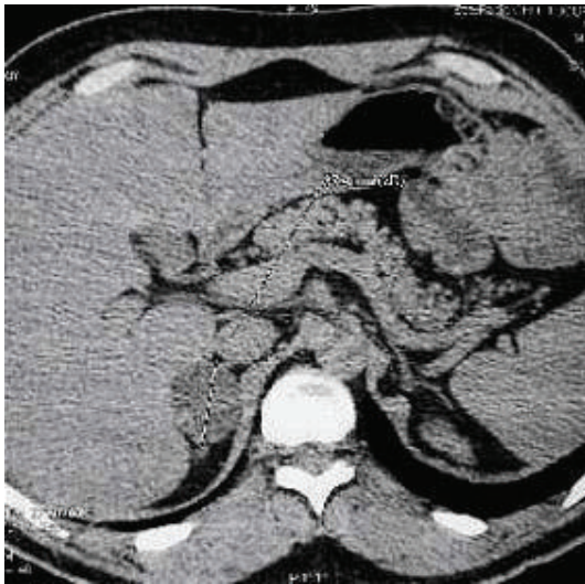
FIGURE 2: CT scan of the abdomen demonstrating a 2.5 \times 4.0 cm mass in the right adrenal gland.

his mother. This patient has one sister and one brother who died at age 19 and 27 years, respectively. In his family, he also has one sister and one daughter who have the mutation gene but are asymptomatic (Figure 1).