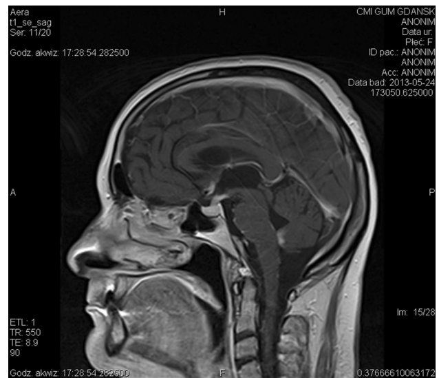
Fig. 2 Neurosarcoidosis in MRI brain in sagittal plane: T1-weighted contrast-enhanced MR image shows basal leptomeningeal enhancement and an extensive enhancement of the pituitary gland and stalk, which is markedly enlarged

parotid and lacrimal glands is called a “panda sign” [45].