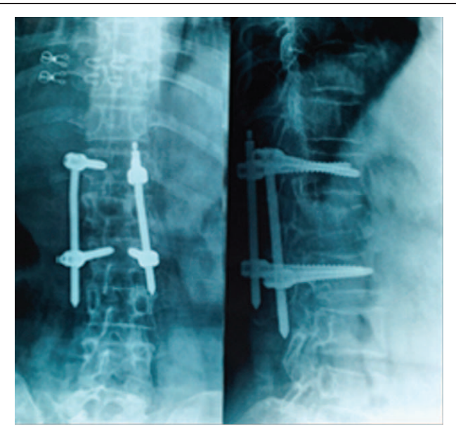
Figure 6. Female, 49 years old, L1 vertebral fracture (type A3): right connecting rod loosening and slipping 6 months after operation without plug off.