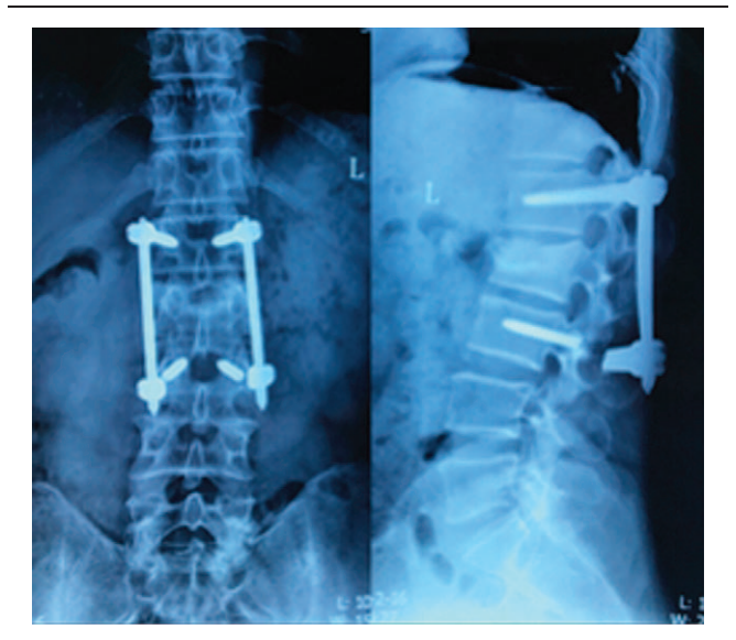
Figure 4. Male, 43 years old, L3 vertebral fracture (type A3): screw breakage at both sides of L3 8 months after surgery.

The late postoperative complications included 8 cases of screw breakage (Fig. 4), and 7 of them occurred 4 to 6 months