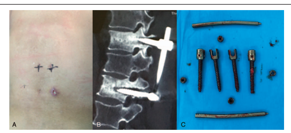
Figure 7. Female, 51 years old, T12 vertebral fracture (type A1): incision infection combined with sinus formation 10 months after operation (A); CT revealed fracture healing with screw loosening (B); removal of implants at revision surgery (C). CT = computed tomography.

We also observed screw breakage, plug screw falling off, and connecting rod loosening in the postoperative follow-up. Short segment fixation without fixation of the injured vertebra could yield a great torque for the internal fixator and thus great stress, which could cause internal fixation loosening, breakage, and correction loss.<sup>[15,16]</sup> Plug screw falling off could be mainly due to a tilted plug screw placement. Of the 5 cases of late infection in