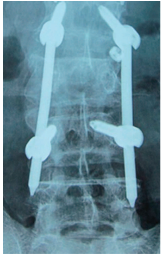
Figure 5. Female, 52 years old, L3 vertebral fracture (type A1): plug screw falling off at the left side of L2 3 months after surgery with connecting rod slipping down.

after operation. Among the 8 patients, 5 complained of discomfort and underwent revision surgery to reinforce the fixation screws, and after 1 year of follow-up, the patients presented good fracture healing; 2 patients showed no obvious discomfort, and the internal fixation was removed 12 months after operation; and 1 patient presented screw breakage 8 months after operation, and CT examination revealed fracture healing. Moreover, 2 cases of plug screw falling off were observed (Fig. 5), 1 of which occurred 3 months after operation and was treated with relocking of the screw under local anesthesia. The other case occurred 6 months after operation and received no special treatment (Fig. 6), and the implantation was taken out after fracture healing. In addition, there were 3 cases of connecting rod loosening, all of which occurred over 6 months after operation. Among them, 2 cases had internal fixation removal, and the other case that presented vertebral height loss received revision open surgery with posterolateral fusion. Five cases presented late deep infection 9 to 12 months after operation. They all presented fracture healing based on CT examination and underwent debridement and internal fixation removal under open surgery (Fig. 7). Pus was collected in all of the 5 patients for bacterial culture, and 1 case was positive for Staphylococcus aureus.