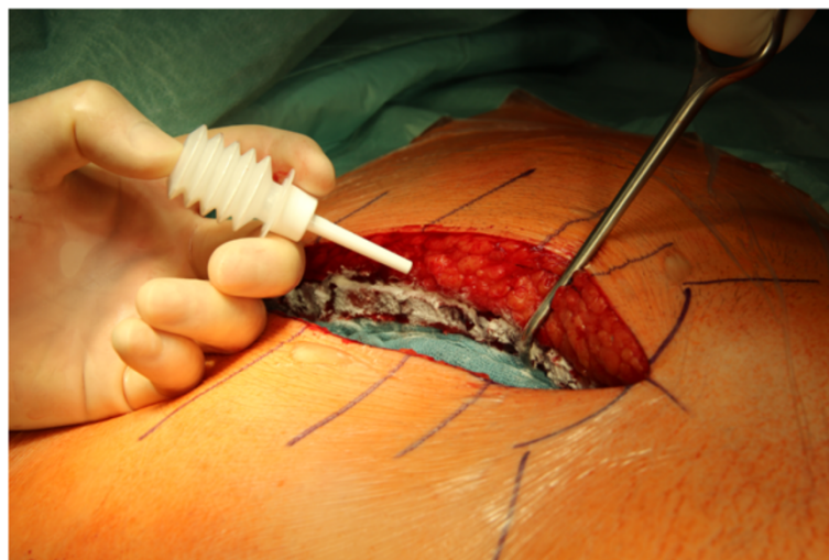
Figure 1 STARSIL® HEMOSTAT applied on both sides of the sternum after median sternotomy.

No adverse events or allergic reactions were observed during the study period. There were no cases of in-hospital mortality or product related morbidity observed during the 3-month follow-up. No re-operations due to graft alteration, bleeding or unstable sternum were necessary. No patient required sternal re-fixation due to