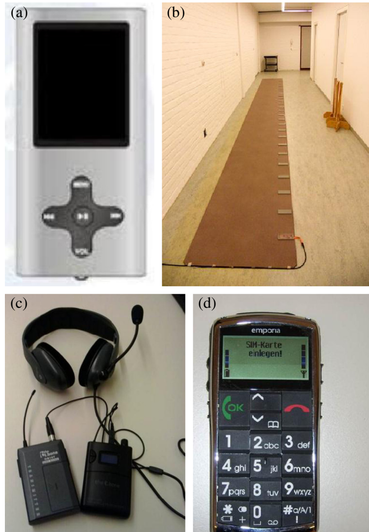
Figure 2 Equipment used during training and testing. (a) MP3-player (DIFRNC MP1850); (b) GaitRite Electronic Walkway System; (c) wireless headset system (Beyerdynamic; transmitter: t-bone DS16T and receiver: t-bone IEM100R); (d) large buttoned mobile phone (EmporiaTalkPremium).

will be adopted as guidelines to progress to the next level. Functional tasks, relevant for each patient, are chosen for the functional part of the training program to ensure generalization of practice (Table 2).