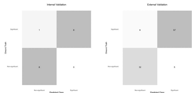
Figure 2 Fourfold confusion matrices for the internal validation and external validation sets.

The development dataset consisted of 179 images, 67 of which were without or with non-significant PCO and 76 significant PCOs (table 1). Intraobserver variability \kappa (95% CI) for the three gradings for observers 1, 2 and 3 were 0.90 (95% CI 0.86 to 0.95), 0.94 (95% CI 0.90 to 0.97) and 0.88 (95% CI 0.82 to 0.93), respectively. Interobserver \kappa for the final grading for all three observers was 0.84 (95% CI 0.78 to 0.89) and that for all nine gradings was 0.82 (95% CI 0.76 to 0.86). Pairwise comparisons between each observer as well as the majority vote are shown in table 2. Interobserver agreement was generally high, ranging from 0.85 (95% CI 0.79 to 0.90) between observers 1 and 2 to 0.90 (95% CI 0.85 to 0.94) for observers 1 and 3.