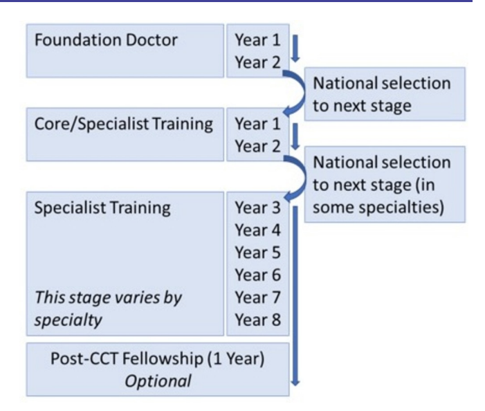
Figure 1 Stages and years of training for UK doctors training to be consultant surgeons. Foundation doctor year 1 is the first stage following graduation from university/medical school. In Ireland, the intern year is the equivalent of the foundation doctor stage in the UK. CCT, Certificate of Completion of Training.

In the UK and Ireland, the JCST is responsible for curriculum development and quality assurance of all the surgical training programmes in the 10 defined surgical specialties (cardiothoracic surgery, general surgery, neurosurgery, OMFS, otolaryngology, paediatric surgery, plastic surgery, trauma and orthopaedics, urology, and