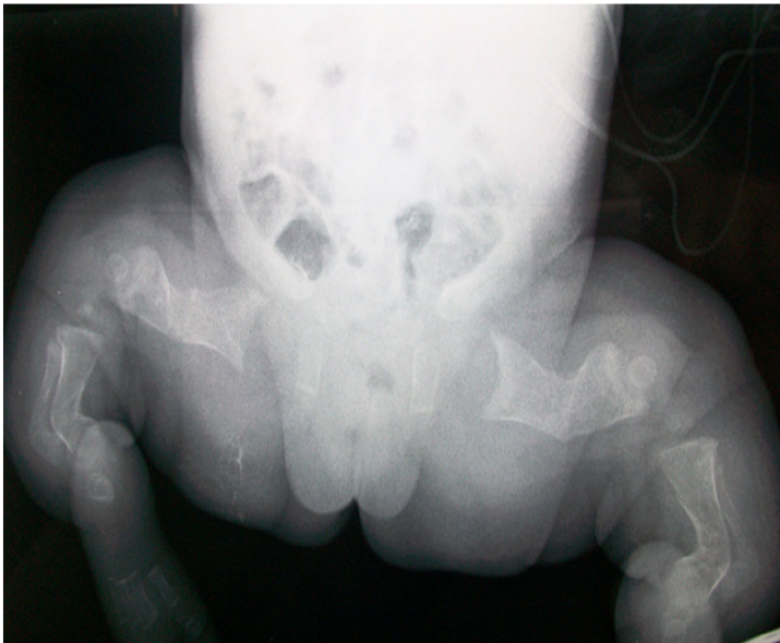
Figure 2: bone demineralization; femur, tibia and fibula deformities with fractures