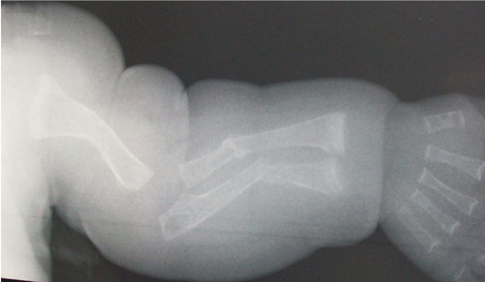
Figure 3: bone demineralization; humerus deformity; radius and ulna fractures with callus formation