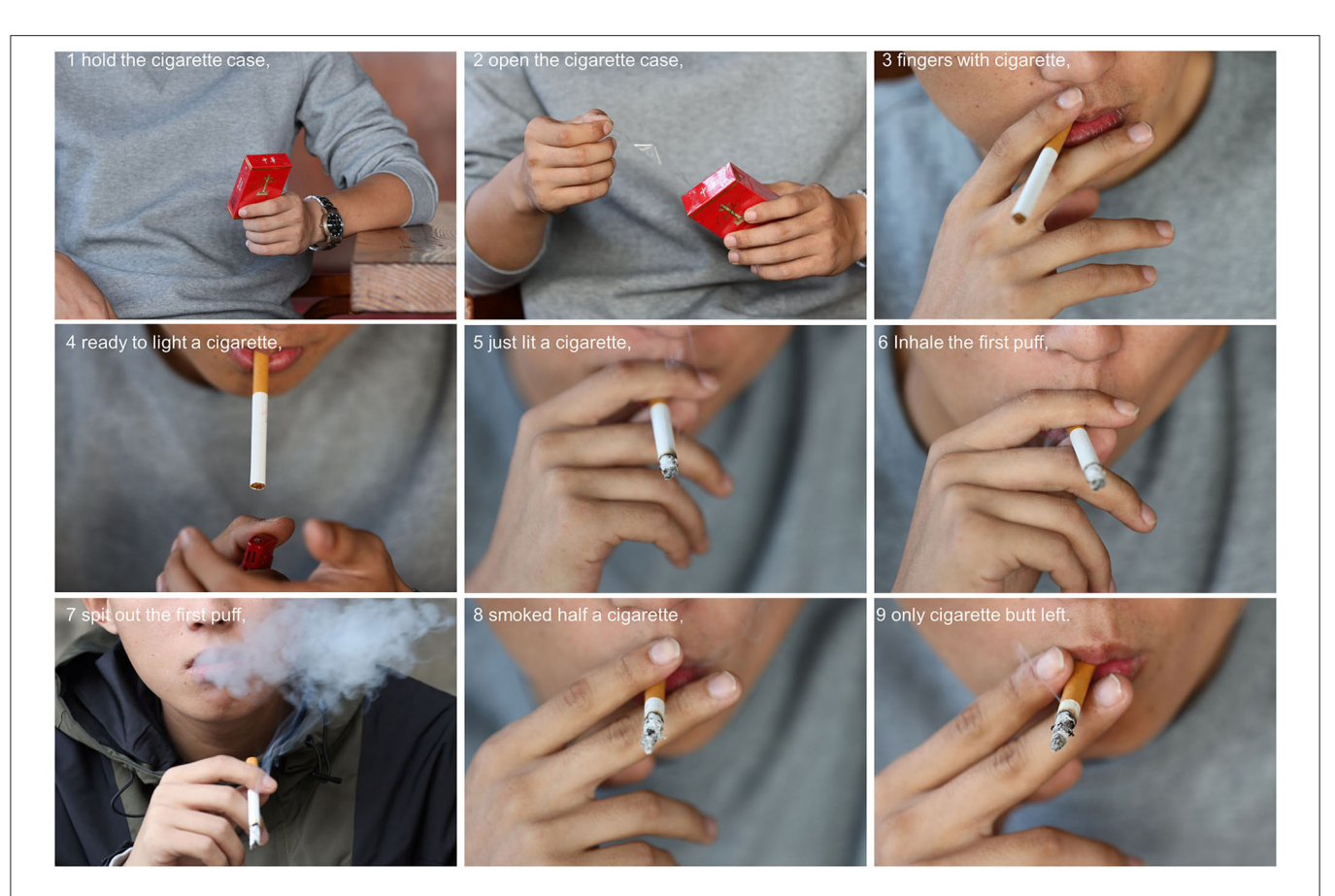
FIGURE 2 | The nine stages of smoking behavior. Participants who smoke a cigarette will follow these stages, and we assume that during this process, the level of craving will change.

scale with normal distribution) were expressed as mean \pm standard deviation (SD), in which logarithmic model parameters were logarithmically transformed; non-normal variables are reported as the median (interquartile range). Continuous normally distributed variables were compared using the variance test. p < 0.05 was considered significant. To control multiple comparison deviations, Bonferroni correction was used. The Pearson correlation and linear regression was used to test the correlation between ratings for cigarette-related pictures, and the correlation between pictures that evoked craving and the FTND score. The rate score is the predicted variable and the FTND score is the predict variable.