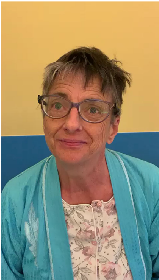
Video 2. Patient 2 Neurological Examination. Video showing choreic movement of the oromandibular region and of the face and neck. Video content can be viewed at https://onlinelibrary.wiley.com/doi/10.1002/mdc3.13432

Data from these papers were summarized using a standardized data form, including sex, age of onset, type of APS (primary,