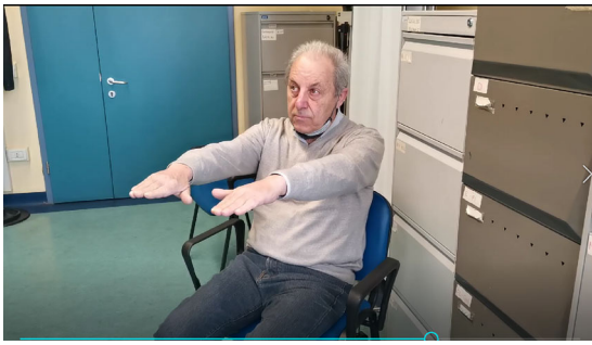
Video 1. Patient 1 Neurological Examination. Video showing generalized choreatic movements involving primarily the oromandibular region and the limbs, with mild prevalence on the right side. Video content can be viewed at https://onlinelibrary.wiley.com/doi/10.1002/mdc3.13432

neurological signs or cognitive complaints (Video 1). Onset was described as subacute. He had no relevant family history, was not on medication and had undergone surgery for an aortic biological prosthetic valve. Laboratory investigations showed no abnormality of blood cell count, coagulation, renal and hepatic function, copper metabolism, anti-neuronal antibodies, antinuclear antibodies, peripheral blood smear, LAC and \beta 2-GPI antibodies. Anticardiolipin antibodies were at the upper normal limit. Genetic testing for Huntington's disease was negative. Brain MRI was unremarkable. Neuropsychological testing confirmed the absence of cognitive impairment.