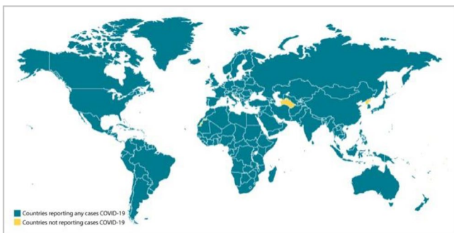
FIGURE 1 World distribution of COVID-19 as of June 26, 2020, 12:00pm ET.

Expectedly, health workers in Nigeria have been hit by the pandemic. Currently, over 800 Nigerian healthcare workers are infected with the