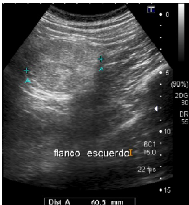
Fig. 1. Ultrasonographic assesment showing heterogeneous mass in the left flank, with an diameter of 60,5 mm.