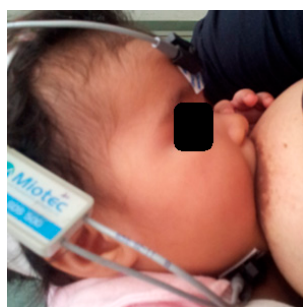
Figure 2. Electromyographic evaluation. Electrodes attached to the bone (forehead) and submandibular (suprahyoid muscles) regions during sucking in breastfeeding.

The mothers received instructions about their positioning, namely, to be seated with their feet on the ground, and about the positioning of the infant, which was to be supported and have the head and the spine aligned straight, with their belly facing the body of the mother and face towards the mother's breast. The infant's mouth was facing the areola and nipple in order to catch the breast. Before the evaluation, the mother received the necessary guidelines on the clinical examination, evaluation of nutritive sucking, and electromyographic examination.