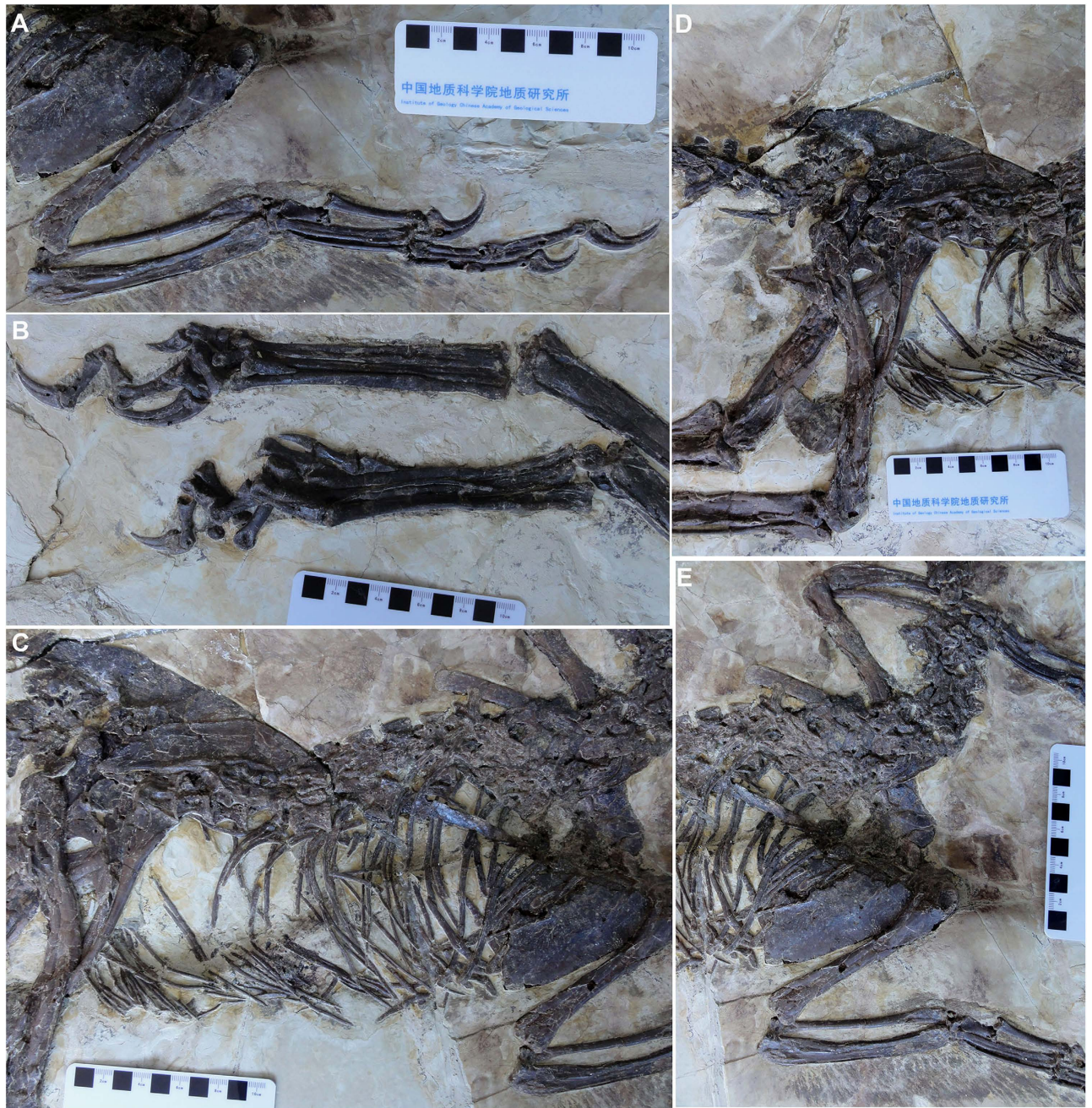
Figure 3. The postcranium of the large-bodied, short-armed Liaoning dromaeosaurid Zhenyuanlong suni gen et. sp. nov. (JPM-0008). (A) right forearm; (B) distal hindlimbs; (C) thorax; (D) pelvis; (E) pectoral girdles.

any Liaoning dromaeosaurid. In comparison, this ratio measures 0.53 in the short-armed Tianyuraptor and more than 0.80 in every other Liaoning dromaeosaurid specimen 10,15 . Similarly, the humerus of Zhenyuanlong is the shortest relative to the femur of not only any Liaoning dromaeosaurid, but any dromaeosaurid in general except for the very basal taxon Mahakala 28 and the aberrant unenlagiine Austroraptor 29 . The humerus-to-femur ratio of Zhenyuanlong is 0.626, compared to 0.65 in Tianyuraptor and a ratio greater than 0.75 in all other Liaoning dromaeosaurids 10,24 .