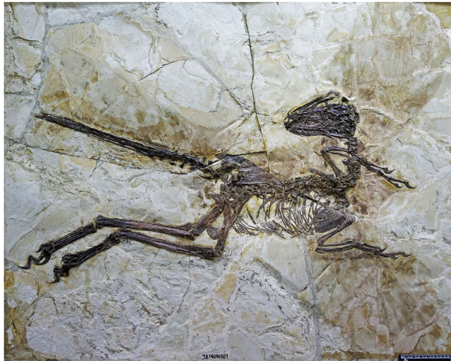
Figure 1. The holotype of the large-bodied, short-armed Liaoning dromaeosaurid Zhenyuanlong suni gen et. sp. nov. (JPM-0008).

were not preserved on this specimen, leaving open the question of what type of integument short-armed dromaeosaurids had and whether they possessed large wings with pennaceous feathers like their smaller Liaoning relatives. This is an especially pertinent issue because, although the flight capabilities of smaller longer-armed dromaeosaurids are still uncertain 7 , the larger short-armed taxa were almost certainly incapable of advanced volant activity 15 . We currently do not know what types of feathers such non-volant paravians possessed.