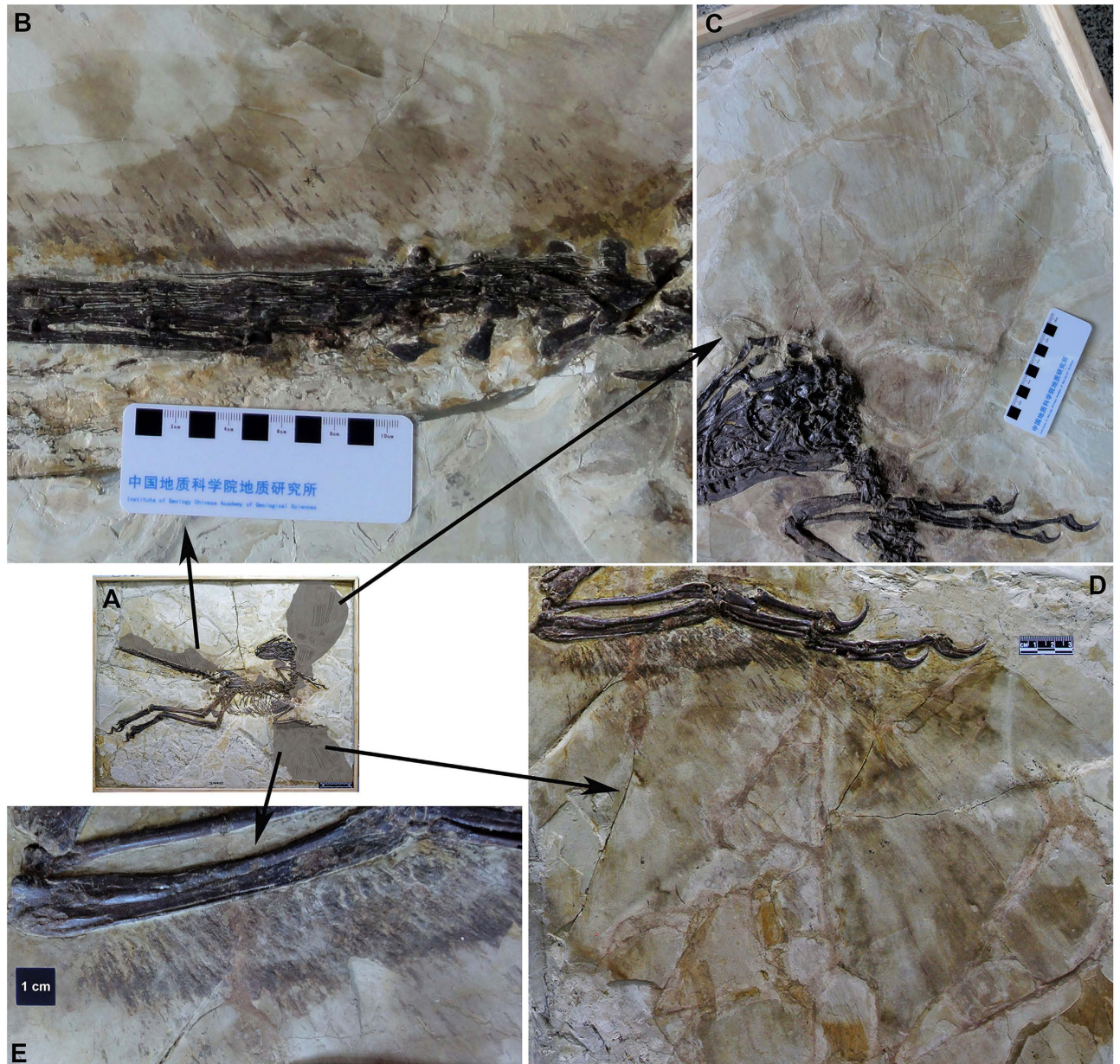
Figure 4. The integument of the large-bodied, short-armed Liaoning dromaeosaurid Zhenyuanlong suni gen et. sp. nov. (JPM-0008). (A) overview of the skeleton with regions of integument indicated with grey highlight; (B) proximal tail; (C) left forearm; (D) right forearm; (E) closeup of coverts on right forearm.

many coelurosaurs bracketing the dinosaur-bird transition, including Sinornithosaurus 23 , Jinfengopteryx 35 , Anchiornis 31 , Eosinopteryx 32 , and likely Archaeopteryx 20 . However, the rachides in the proximal portion of the tail of Zhenyuanlong appear to be longer than those of Microraptor 5,6 and Changyuraptor 10 , which had relatively small and simple feathers proximally on the tail but much larger and more complex feathers distally, which expanded outwards into a large fan. Because the distal tail is not preserved in Zhenyuanlong , the presence or absence of this fan cannot be assessed.