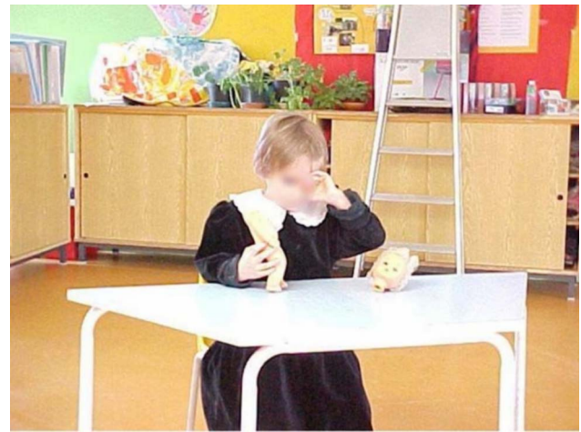
Figure 3 A young girl crying because she has broken her doll.

The pictures had been previously tested on two classes (not included in this study).