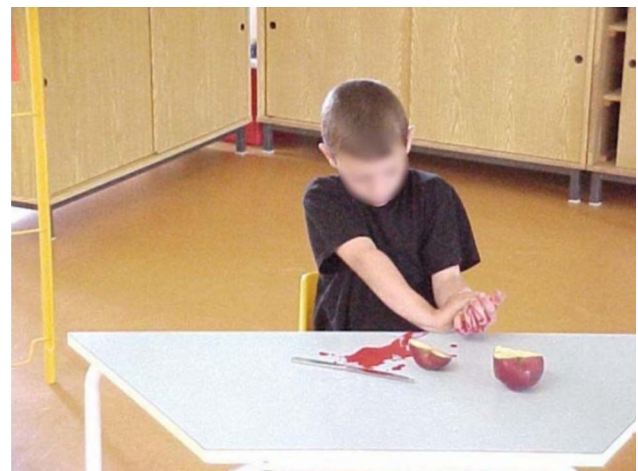
Figure 4 A young boy who has injured his hand while peeling an apple.

To ensure anonymous grids, the results were collected by Ministry of Education staff. For reasons of confidentiality required by the national education system, the researchers did not have access to personal data from children. Only fully completed assessments were analysed. Data were presented as percentages with 95% CIs. Statistical analysis of the results was performed using a \chi^2 test (significance level: p < 0.05 ). Analyses were