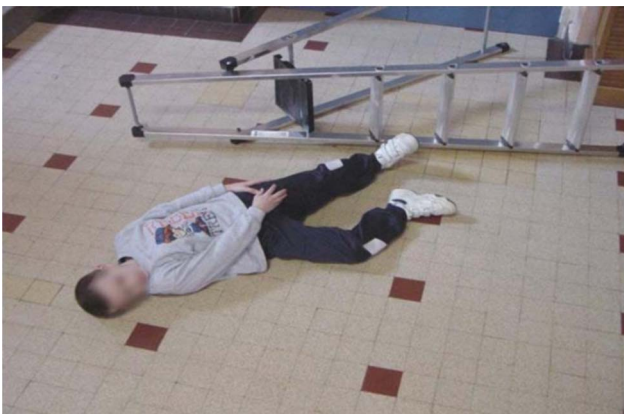
Figure 2 A boy who has fallen off a stepladder and is holding his leg.