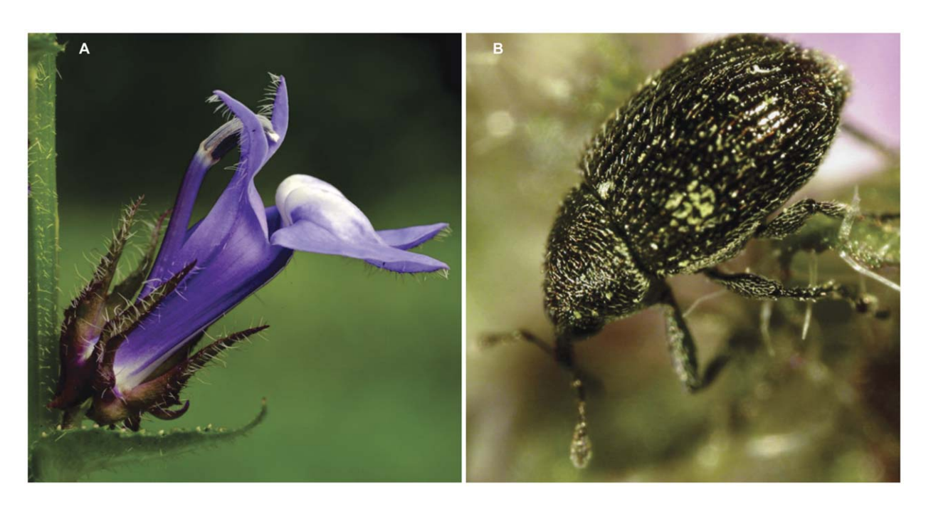
Figure 1. Lobelia siphilitica flower (A) and its specialist pre-dispersal seed herbivore, Cleopmiarus hispidulus (B). doi:10.1371/journal.pone.0037745.g001