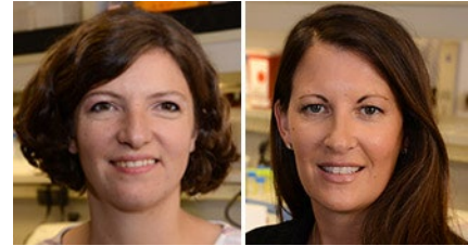
Insight from Lavinia Palamiuc and Brooke M. Emerling

Prostate-specific membrane antigen (PSMA) has become a popular target for developing new diagnosis tools designed to improve stratification of patients for targeted personalized therapeutic regimens (Pillai et al., 2016). PSMA is moderately expressed in several tissues, including healthy prostate tissue; however, it is greatly up-regulated in prostate cancer (Israeli et al., 1994). PSMA has two types of catalytic activities: NAALDase and folate hydrolase,