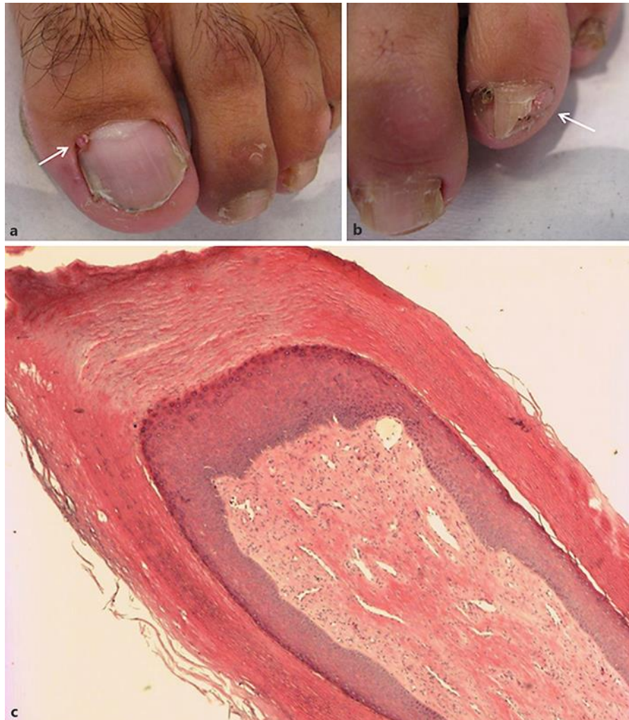
Fig. 1. a, b Clinical photographs of unguis fibromas (arrows). c Histopathological analysis of a skin biopsy obtained from a papule at the proximal nail fold, consistent with an unguis fibroma.