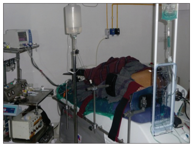
Figure 1: The patient lies in lateral decubitus with the transrectal ultrasound probe inserted for imaging as well as focussed ultrasound emission. The probe is surrounded by a coupling gel (Ablasonic gel) in a balloon. The Ablasonic fluid in a 5°C bath produces a peri-probe temperature of 16-18°C to cool the rectal wall. The patient is warmed by a warmer and covered with blankets to avoid inadvertant hypothermia

After inducing the patient with spinal and epidural anesthesia, the patient was placed in the lithotomy position. Transurethral resection of the prostate (TURP) was done in all patients with transrectal ultrasound prostate AP dimension of more than 25 mm or calcification at the junction of the transitional and peripheral zone.<sup>[5]</sup> The patient was then transferred to the Ablatherm platform and secured in the right lateral position with appropriate protection of all pressure points [Figure 1]. After introducing the rectal probe, anatomic limits were echographically set. Then, the procedure was started with the probe (equipped with the transducer) giving out a beam of highly focused convergent ultrasounds. Adequately translating the focal point with a robotic and automatic device, the successive ultrasound emissions destroyed all prostate cells. A 20-Fr