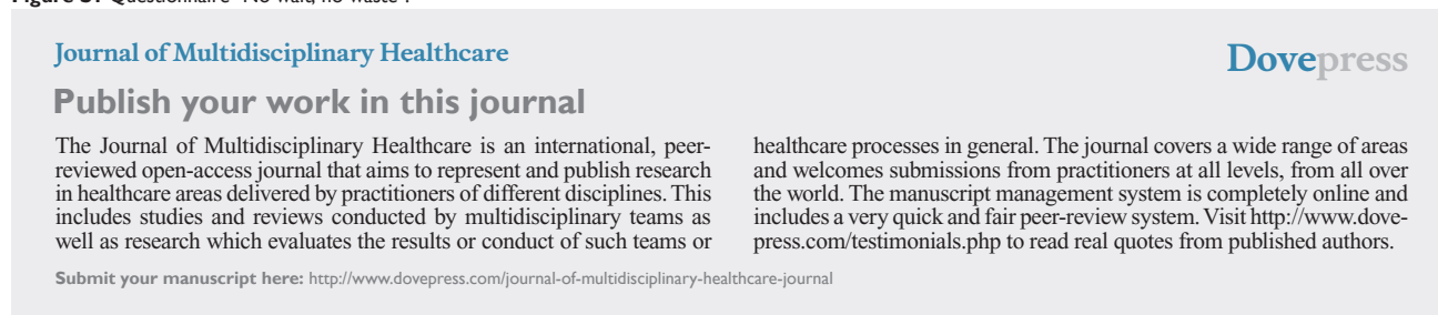
Figure S1 Questionnaire "No wait, no waste".