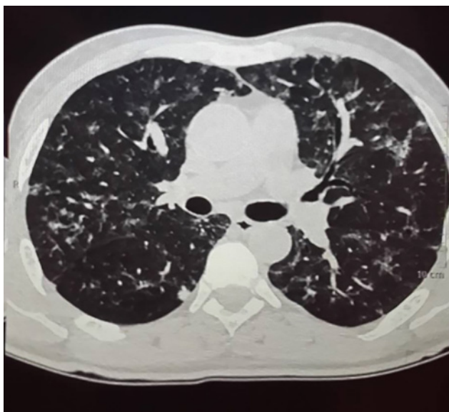
Fig. 1 High-resolution computerized tomography (HRCT) chest shows patchy areas of ground-glass opacities (GGOs) in both lower lobes and few areas of subpleural GGO and nodular lesions (suggestive of organizing pneumonia pattern).

Spirometry was normal in 3 cases and showed mild restrictive defect in 15 cases. DLCO was tested in 15 cases and showed diffusion impairment in 8 cases, which was mild to moderate (range, 76–54% predicted).