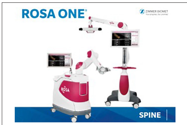
Fig. 3. The ROSA ONE Spinal Robotic Platform (Zimmer Biomet).