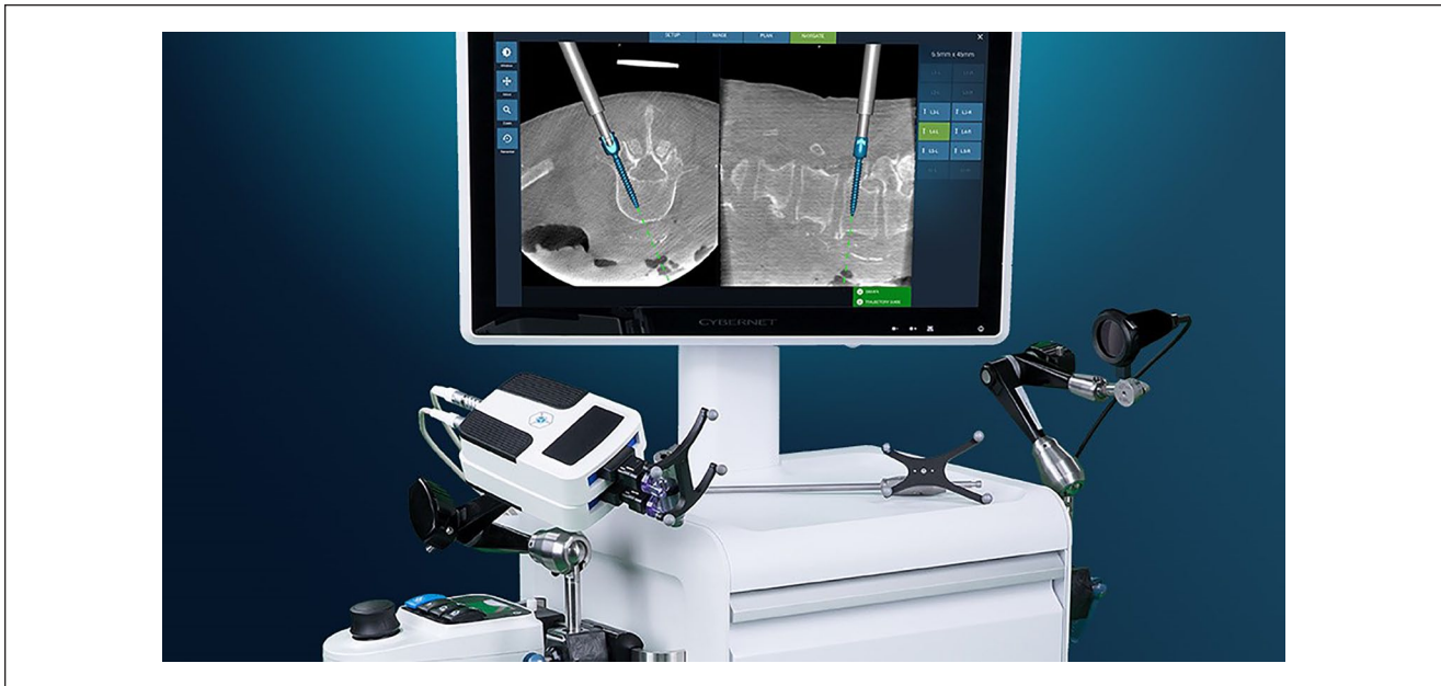
Fig. 5. Fusion Robotics LLC spinal robotic platform.