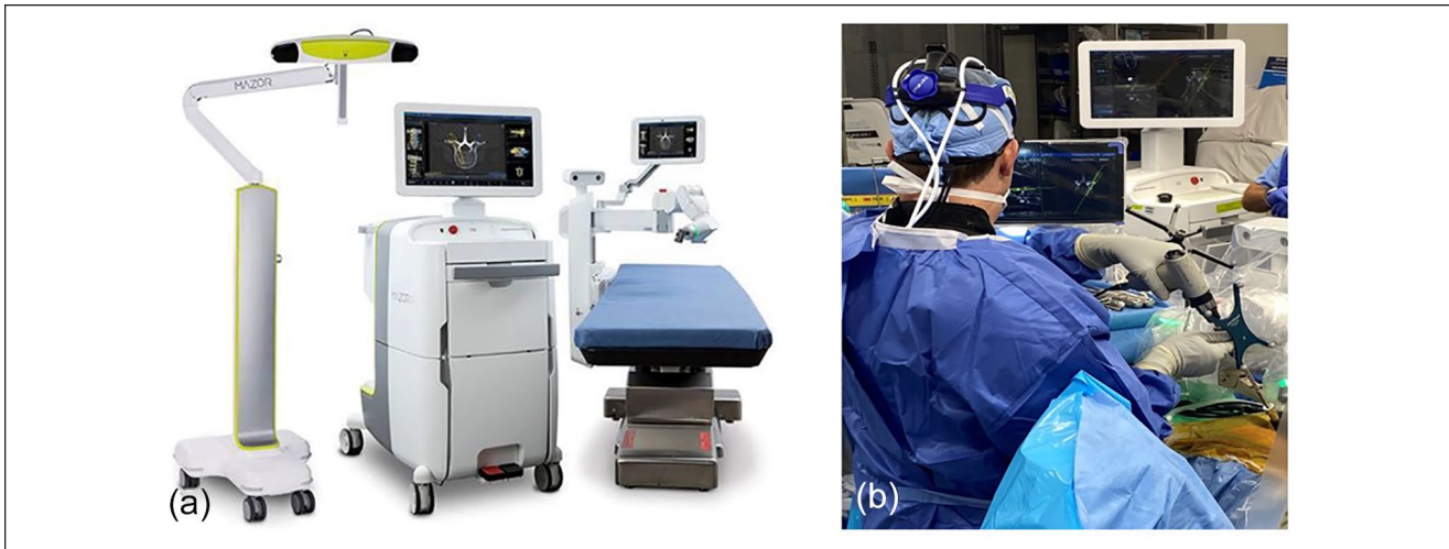
Fig. 1. (a) Mazor X Stealth Edition Spinal Robotic Platform (Medtronic Navigation Louisville, CO, USA; Medtronic Spine, Memphis, TN, USA) and (b) Intraoperative image demonstrating utilization of the Mazor Robotic platform to place lumbar pedicle screws in the prone position.