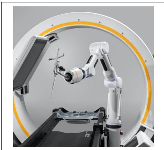
Fig. 4. The Cirq spinal robotic platform (Brainlab AG).

2019, and its accuracy for placing cervical instrumentation has recently been assessed (Fig. 4) [10,21]. More recently, the Fusion Robotics spinal navigation and robotics system (Boulder, CO) received FDA clearance in February 2021 (Fig. 5). Finally, the TiRobot (TINAVI Medical Technologies, Beijing, China) was approved in China in 2016 but not in the United States. Like the ROSA platform, the TiRobot can also be used for other orthopedic applications outside of spine surgery.