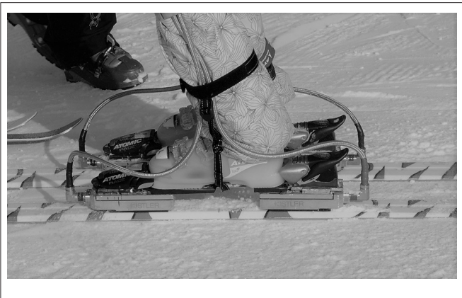
FIGURE 1 | Set up of the FP between the bindings and the skis.

capacitive sensor. The PI were located inside the liners of the ski boots and the proper size was selected for each skier and replaced their normal insoles. All pressure insoles were calibrated prior to the measurements following the manufacturer's instructions. The Novel data logger, battery pack, and trigger switch were carried in a belt (1 kg in total) attached to the Kistler backpack.