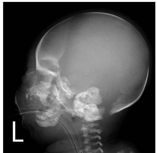
Fig. 2. Skull radiography showing cortical hyperostosis of the bilateral orbital rim, mandible, and skull base.