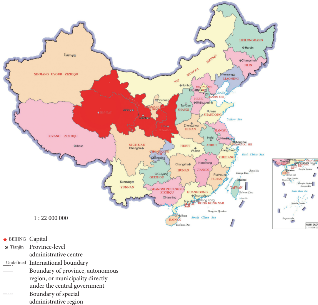
FIGURE 1: The location of the three research areas on the map of China (marked red).