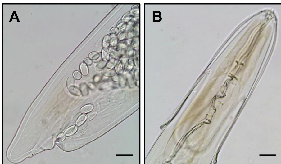
Fig. 2 Desportesius sagittatus female specimen. a: posterior end (scale bar: 34 \mu\text{m} ); b: anterior end (scale bar: 67.4 \mu\text{m} )

In what refers to nematodes, until the year 2015, only Austria, Czech Republic, Germany, Poland and Slovakia had information regarding helminth communities in storks [13]. The genus Desportesius (Nematoda: Acuarioidea) usually parasitizes birds of the order Ciconiiformes [17]. These nematodes occur under the gizzard lining [16], but nothing is known about their pathogenic effects on the hosts [14]. Desportesius sagittatus has also