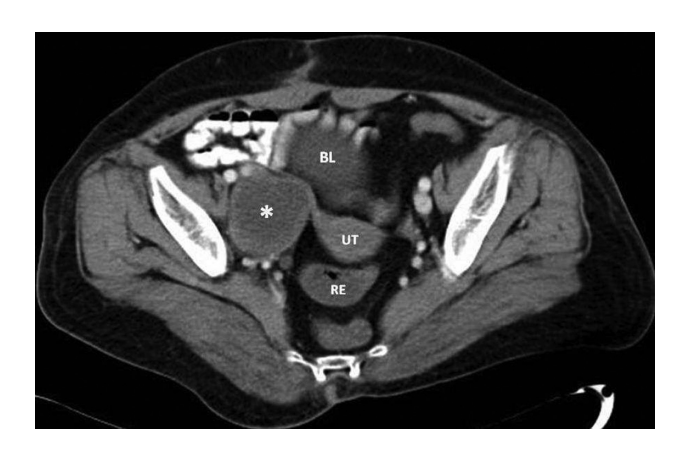
Figure I Axial, enhanced computed tomography image of the pelvis demonstrates a mass in the anatomic region of the right ovary, corresponding to the ovary's schwannoma.

The preoperative findings showed we had to deal with a retroperitoneal tumor of unknown pathology in a menopausal woman. In order to ensure the optimum treatment and survival for our patient, we performed laparotomy with total abdominal hysterectomy and en-block tumor excision. The abdomen was opened through a lower midline incision. A large retroperitoneal mass, measuring 6.5 \times 5.5 cm, was noted in the right parametrium and was in close proximity to the interal-iliac vein, which was ligated (Figure 2). A frozen section was taken during the surgery before complete resection of the mass, which was ambiguous. Because of the possibility of malignancy, complete excision of the mass was performed with pelvic