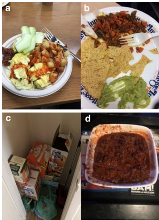
FIG. 3. Photos depicting the theme of alternate ways to get food: (a) a meal obtained while working, (b) free food from a student group meeting, (c) nonperishable snacks provided by the student's parents, (d) food brought back from a trip home.

Another student described visiting his family to bring extra food to campus (Fig. 3d). He said, "I warn my parents when I'm going to come home and sometimes my mom will cook extra for me. That weekend I not only wanted to see my family, but also I wanted to have food to bring back."