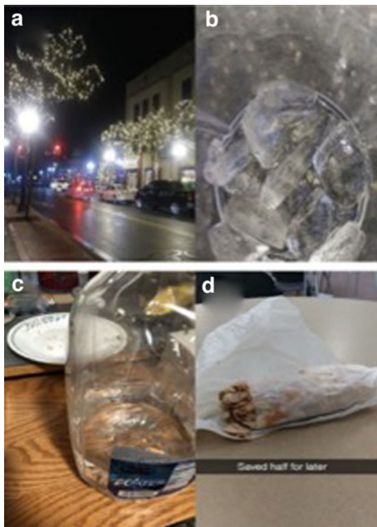
FIG. 2. Photos depicting the theme behavioral coping mechanisms for food insecurity:

In one example, a student forgot her packed lunch at home and purchased a sandwich on campus. She felt guilty about this “unnecessary purchase” and made it last for two meals (Fig. 2d). Another student shared the frequency of eating that she was able to feel fullness, “Maybe about half the time when I eat I feel full. I wish I had more food I could eat, that there was more food available that I could use to make myself feel more full.”