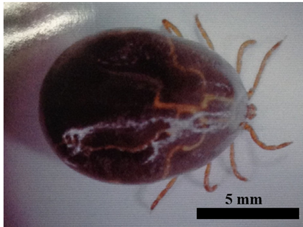
Fig. 1. A swollen tick after feeding on host blood. This tick ( Haemaphysalis ) was removed from another patient who attended our hospital.

The total serum IgE level increased to 504 IU/mL. However, the allergen-specific IgE screening test showed negative results, except for positive results for honey bee and yellow jacket antigens.