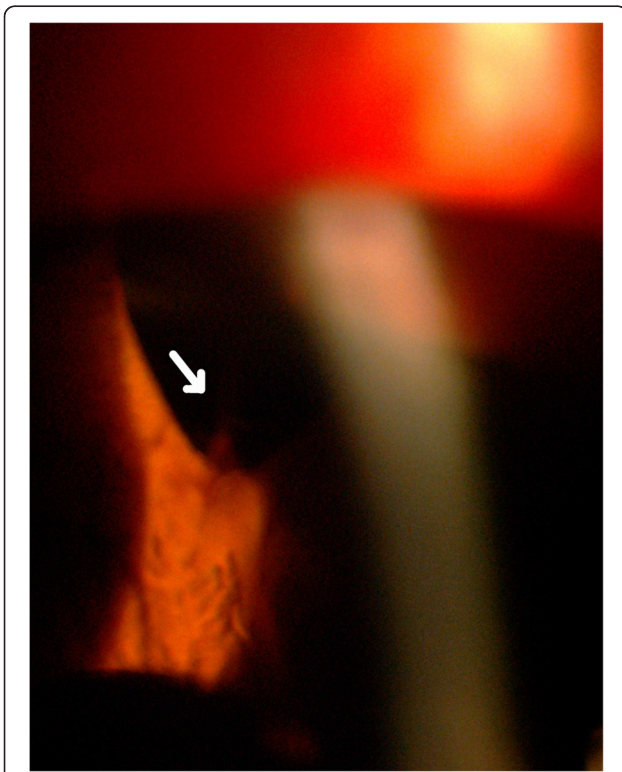
Figure 1 Slit-lamp photo of the left eye. Slit-lamp examination of the anterior segment revealing active bleeding in the anterior chamber. Blood coming out from the superior iridectomy (arrow).

In July 2011, a 60-year-old caucasian male came to our Department referring recurrent episodes of hyphema in the left eye (LE). The patient reported no previous eye trauma, systemic hypertension or other systemic diseases and the bleedings were not associated with any physical efforts or drugs such as anticoagulants. He referred bilateral cataract extractions 7 years before, followed by trabeculectomy two years later in both eyes. At the moment of our observation the patient was under maximal topical medical therapy for glaucoma with timolol, apraclonidin, brinzolamide and acetazolamide because of the failure of filtering surgery. Best corrected visual acuity (BCVA) was 20/20 in the right eye and 20/40 in the left eye. At the slit-lamp examination the intraocular lens (IOL) was placed in the sulcus in both eyes and an active bleeding in the anterior chamber of the LE causing hyphema was present (Figure 1). The cataract surgery was done in another hospital and there was no information about the reasons of the position of the lens in the sulcus. In fact the posterior capsule was normal and there was no other alteration that can be related to surgical complications. The position of the haptics was studied with UBM and they seemed to be in the right place and far from iridectomy. Anterior segment in the