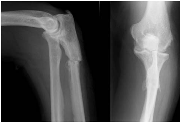
Fig. 1 Anterior-posterior (AP) and lateral plain radiographs demonstrate a transverse fracture through the proximal metaphysis of the ulna

A repeat plain radiograph at 5 weeks showed signs of fracture union. However, in view of the unusual site of the fracture, a magnetic resonance imaging (MRI) scan was requested. MRI was performed on a 1.5 tesla Siemens scanner using a body coil as the patient's body habitus did not permit the use of a surface coil available in our institution. The quality of the resulting scan was therefore slightly suboptimal. MRI showed features of a healing stress fracture in the proximal ulna. In addition, there was bone marrow oedema in the proximal radius without a definite fracture line—appearances consistent with a stress reaction (Fig. 2a–c). There was no evidence of neoplasm or infection. A subsequent computed tomography (CT) scan showed no fracture line in the radius and no signs of underlying bone pathology in either of the bones (Fig. 3). The patient reported improvement in symptoms upon clinical review. We have received written consent from the patient for publication of this article.