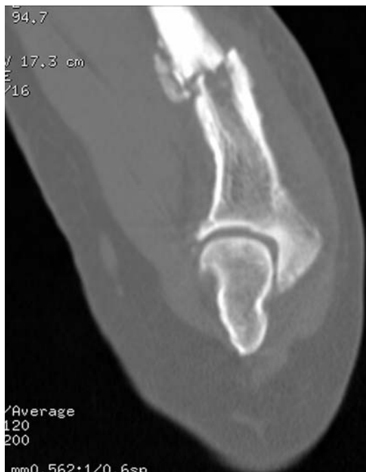
Fig. 3 Computed tomography (CT) scan of the left forearm; Sagittal reformat shows the transverse fracture through the proximal ulnar metaphysis with associated callous formation

fractures if the clinical history is not clear or when such fractures occur in the setting of an underlying primary malignancy elsewhere.