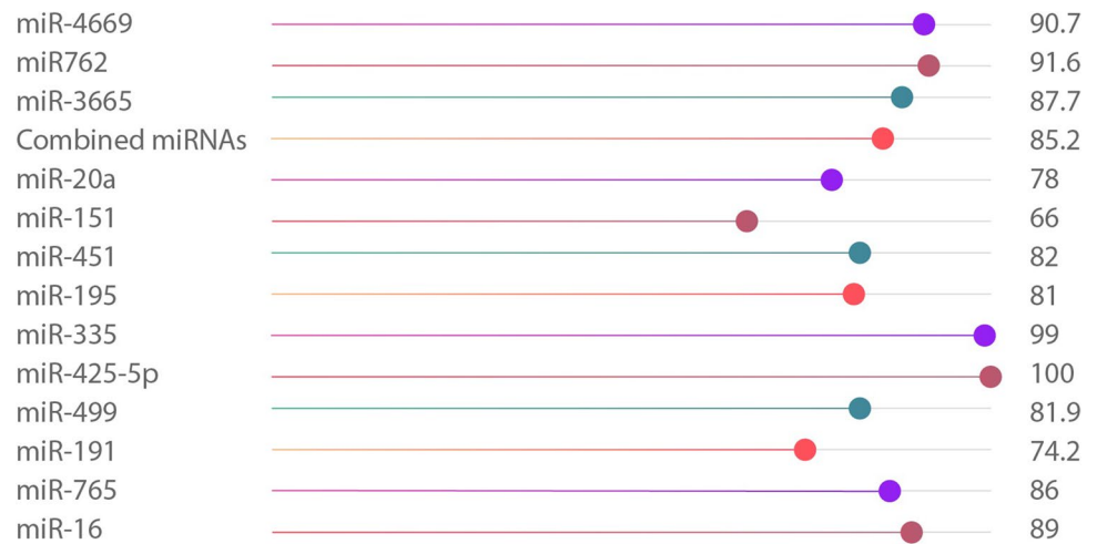
Fig. 2 Bar chart showing area under the curve of diagnostic accuracy of miRNAs in TBI diagnosis. *Combined miRNAs = miR-29c-3p + miR-26b-5p + miR-30e-5p + miR-182-5p + miR-320c + miR-221-3p. Data are generated from the studies listed in Table 2

have been detected, of which ten existed at both TBI severities. Four out of these ten miRNAs have also been detected in the CSF [100].