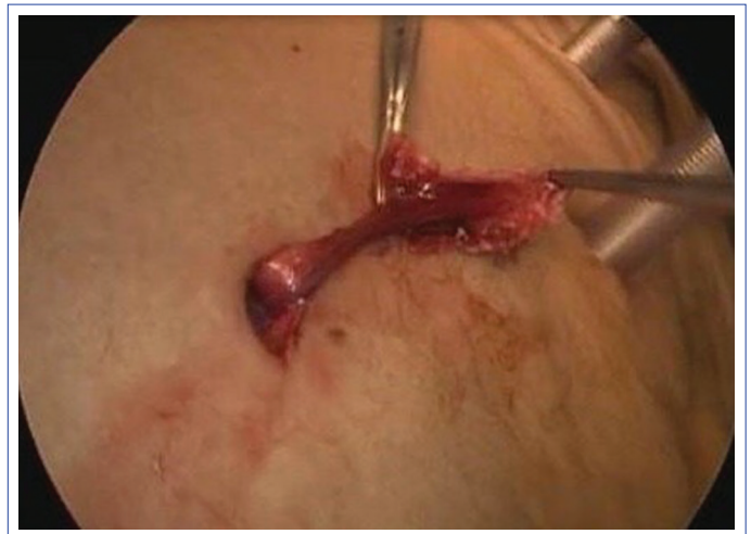
Figure 1. Extracorporeal spatulation.

Dismembered pyeloplasty was performed for all 36 patients in this study. Fifteen of them were operated with open pyeloplasty including flank incision (Group 1) and 21 of them were operated with transperitoneal laparoscopic pyeloplasty (Group 2). In Group 2, JJ stent was placed intracorporeally for six patients (Group 2a) and after these patients, all new cases with a number of 15, stent was handled extracorporeally (Group 2b). In extracorporeal method, ureteropelvic area was visualized transperitoneal by three trochar, UPJO was excised and ureter dissected. Thereafter, ureter is taken out of the skin from pelvic trochar entrance and is spatulated (Fig. 1). JJ stent is placed into the ureter (Fig. 2). Following this move, ureter is taken into the intra-abdominal area and first ureteropelvic suture is performed intra abdominally.