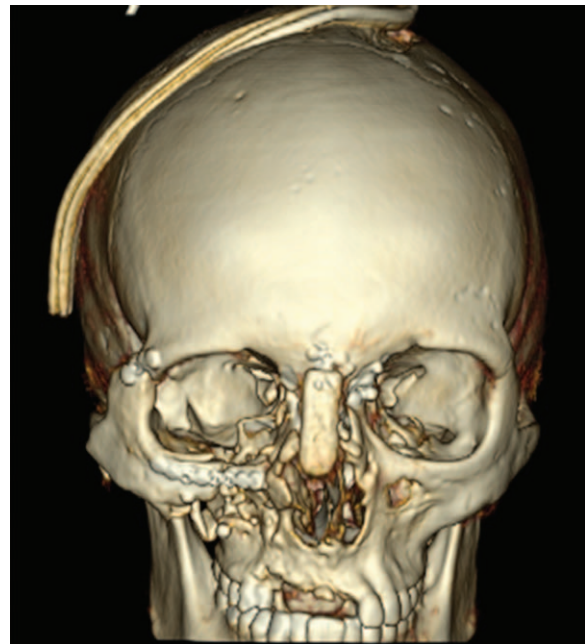
Fig. 2. Postoperative CT scan after initial revisional procedure without the use of intraoperative imaging. Note the position of the right zygoma compared with the left with increase in the right-sided orbital volume.

approximation. The use of intraoperative imaging allows for immediate repositioning during the initial procedure if needed, thereby preventing a potential reoperation. Among the available modalities, C-arm