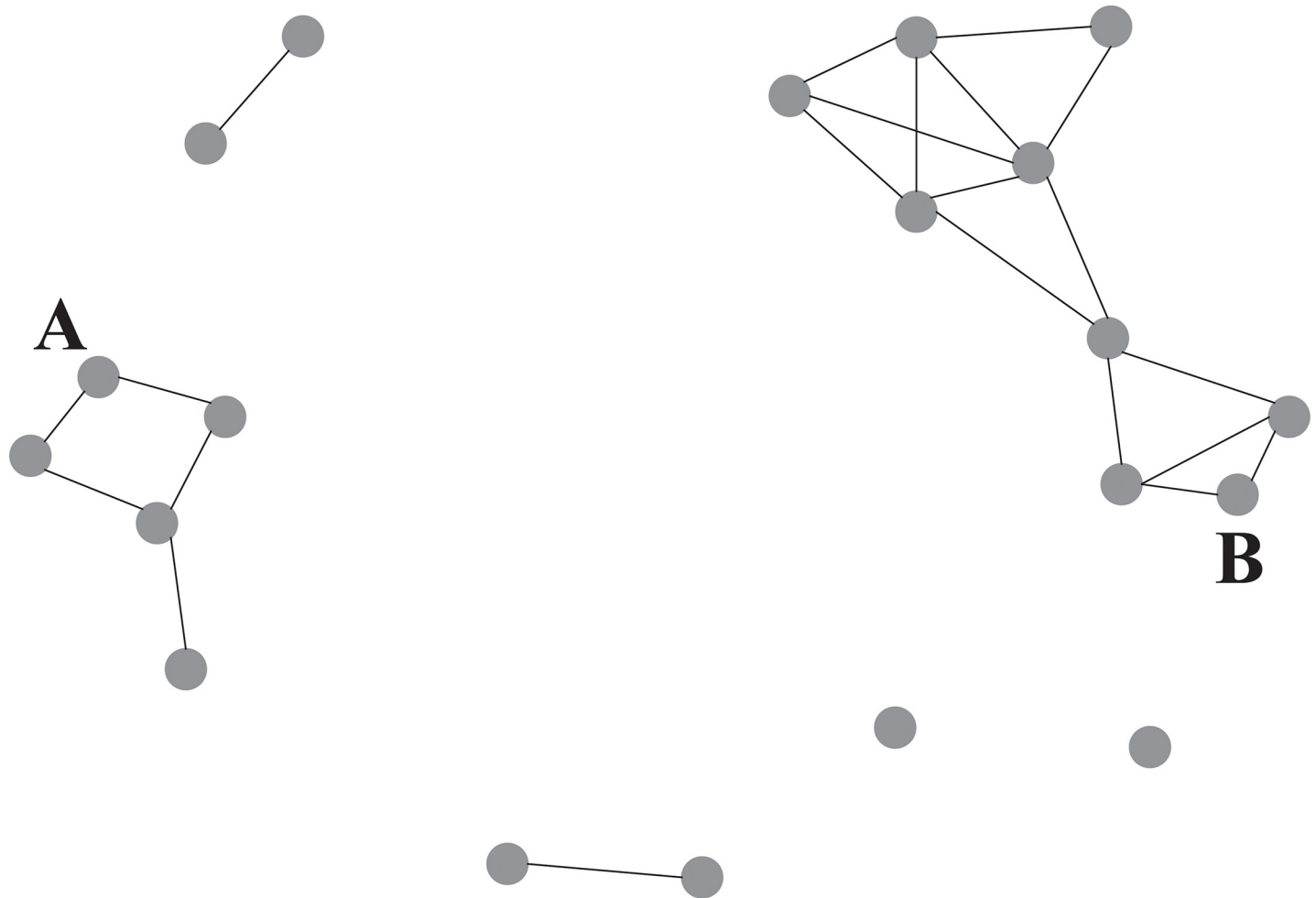
Fig 3. Sociogram of a help network with high segmentation (value .92) and low inequality (value .10), highlighting individuals with relatively low (A) and high (B) centrality.

https://doi.org/10.1371/journal.pone.0208173.g003