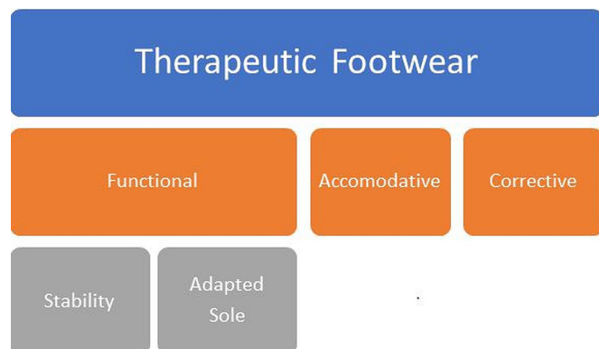
Figure 5 Terms and groupings of clinical footwear interventions for children derived from section 1.