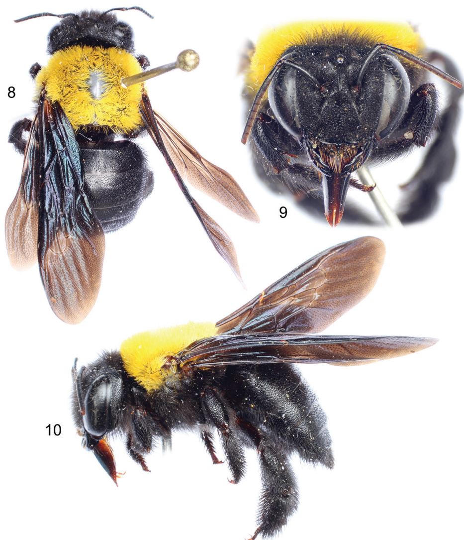
Figures 8–10. Female of Xylocopa ( Koptortosoma ) sarawatica Engel, sp. n. 8 Dorsal habitus 9 Facial view 10 Lateral habitus.

Paratypes. 1♀, Saudi Arabia, Asir [‘Asir Region], Abha, Sodah, nr. dam, 2500 m, 18°14'11.64"N, 42°24'49.96"E, 22-v-2012 [22 May 2012], M.S. Engel (SEMC); 1♀, Saudi Arabia, Al Baha [Al-Baha Region], Thy Ein [Thy ‘Ain] village, 690 m, 19°55'59.61"N, 41°26'41.41"E, 25-v-2012 [25 May 2012], M.S. Engel (SEMC); 4♀♀, Saudi Arabia, Baha [Al-Baha Region], Thee Ain [Thy ‘Ain] Village, 690 m, 19°55'59.61"N, 41°26'41.41"E, 25-v-2012 [25 May 2012], M.A. Hannan (3♀♀ SEMC, 1♀ K SMA); 1♂, 1♀, Saudi Arabia, Al Baha [Al-Baha Region], The Ain [Thy ‘Ain], 5.5.2015 [5 May 2015], M. Shebl (K SMA); 1♀, Saudi Arabia, [Al-Baha Region],