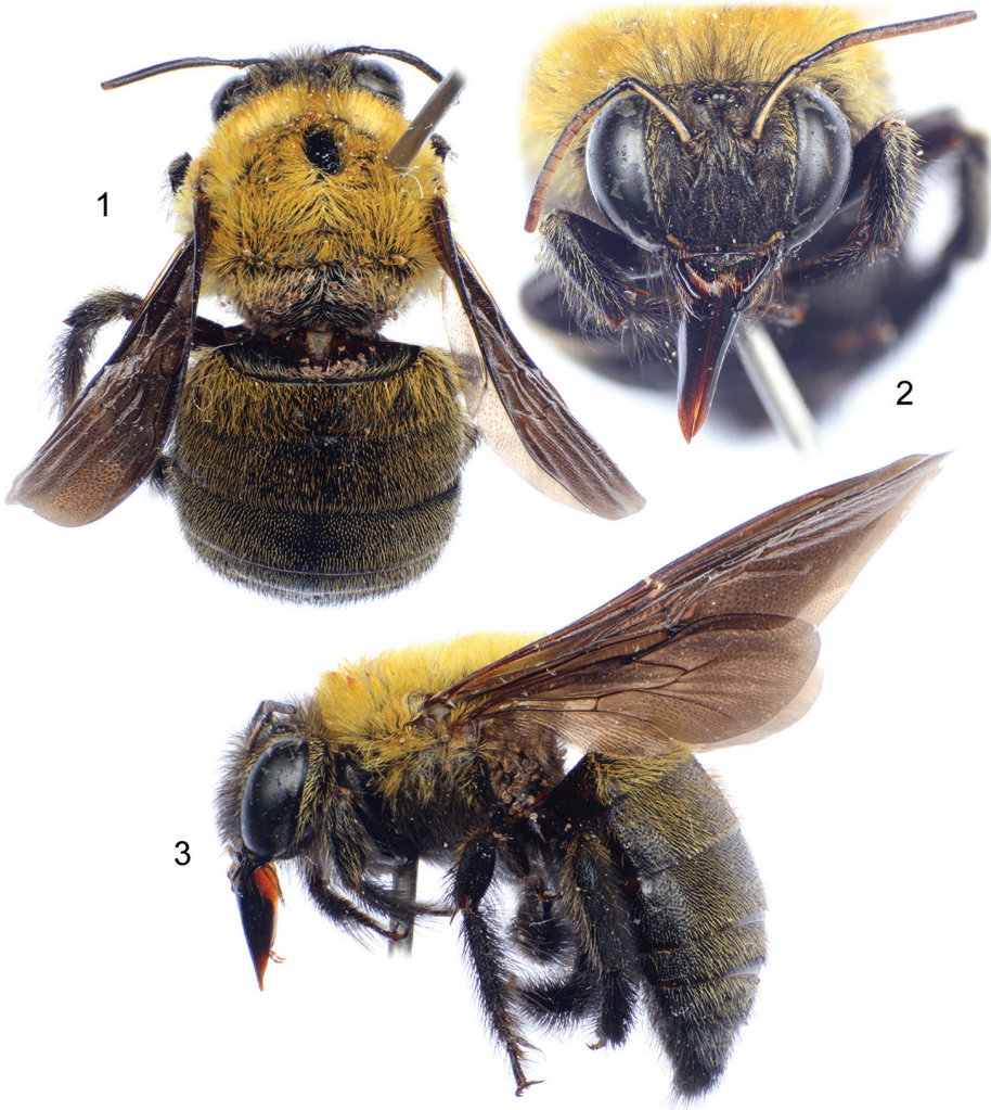
Figures 1–3. Male of Xylocopa ( Koptortosoma ) sarawatica Engel, sp. n., from southern Saudi Arabia. 1 Dorsal habitus 2 Facial view 3 Lateral habitus.

at bases of setae; propodeum with setigerous punctures separated by a puncture width or slightly more, integument between punctures imbricate. Metasomal tergum I with small punctures separated by a puncture width or more, integument between punctures dull and imbricate, punctures becoming progressively more densely packed laterally; punctures centrally on terga II–III similar to those on tergum I except slightly more closely spaced, particularly so apically on tergum III; punctures centrally on terga IV–V less well defined and denser than those on discs of preceding terga; punctures centrally on tergum VI similar to preceding terga except even more poorly defined and shallow; sterna with setigerous punctures widely spaced in basal halves, becoming more closely spaced apically and laterally on each sternum.