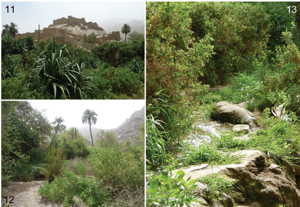
Figures 11–13. Habitat at the Thy 'Ain type locality, near Al-Baha in Al-Baha Region, Saudi Arabia. 11 The ancient village (the 'Marble Village') and surrounding vegetation 12 General vegetation at locality 13 Vegetation alongside part of small water seep.